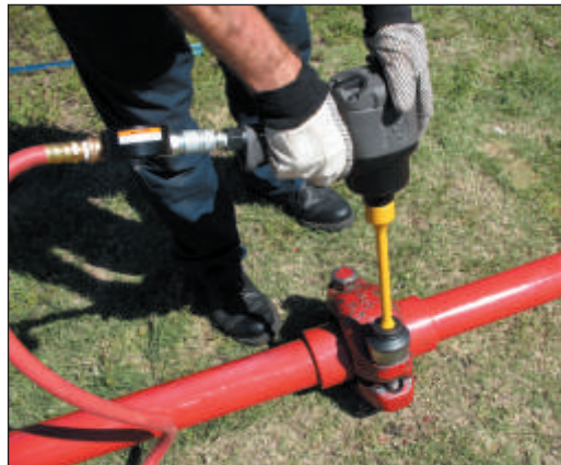
The use of the Weir SPM Torque Regulating Bar allows for consistent torque being applied to bolts. This ensures each connection is made up to its required torque rating, providing a safe, reliable seal.

For ultimate safety on site, Weir SPM suggests applying Safety Iron™ along with the Flow Line Safety Restraint System.