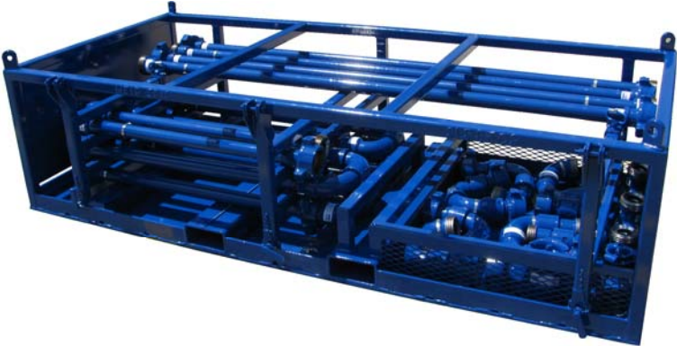
Figure 3 – Pipe & Hose Loop Installation