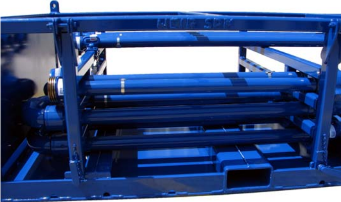
Figure 3 – Swivel, Valve and Integral Installation