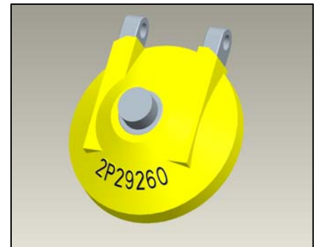
Fig. 2 – Enhanced Clapper Design – cross sectional view