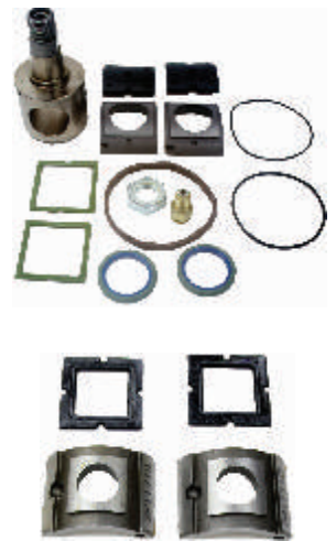
Weir SPM plug valve part kits contain all the components necessary to rebuild valves in the field or in the shop. Weir SPM seal kits contain all items in the standard repair kit, except the plug. For proper sealing of the valve, seal segments should be replaced in pairs. Individual components and elastomer kits are also available.