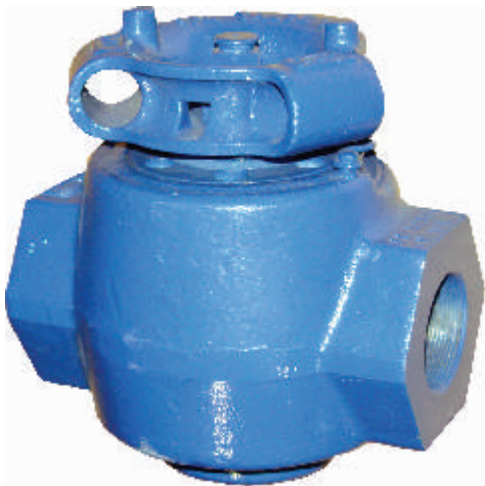
Weir SPM plug valves are available in LTPL (above), hammer union, or Safety Iron™ (below) end connections.

Plug valves are available in standard service and sour gas service models. Special models are available to 20,000 psi. Special models are also available for torture valve applications.