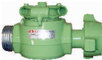
Standard, cold-temperature and sour gas service models are available.