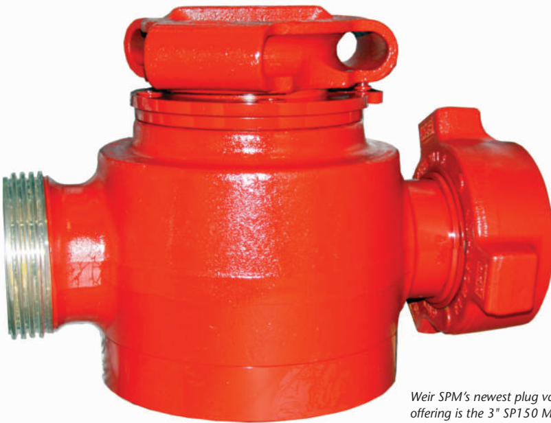
Weir SPM's newest plug valve offering is the 3" SP150 Manual Actuated Plug Valve.