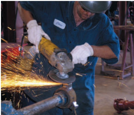
Weir SPM's iron recertification services help customers conveniently qualify their iron and return it to the field with new high-quality Weir SPM component parts.