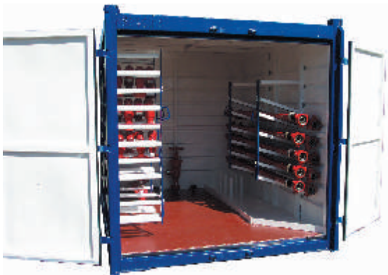
Weir SPM Rental Packages are available for convenient delivery in both onshore (above) and offshore (left, right) packages.