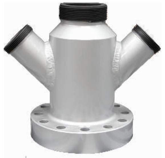
"Inlet" Style Frac Head