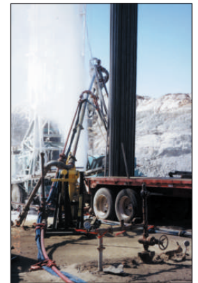
Along with the CO 2 check valve, the Flow Line Safety Restraint System is a proven tool to create a safer environment during volatile CO 2 and Nitrogen pumping operations.