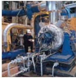
Optimum maintenance ensures operating efficiency is improved

We have the comprehensive skill set to meet a broad range of customer and process demands. We provide maintenance and service of rotating plant and associated equipment of our own products and all other major brands.