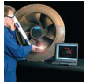
Re-engineering of parts to reduce cost and delivery times