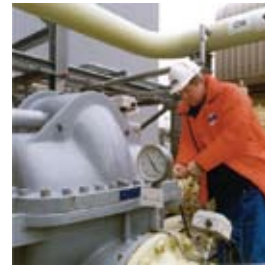
Condition monitoring is used to identify areas for improvement